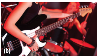
Figure 1 (a) A toaster and (b) an electric guitar transform electrical energy.