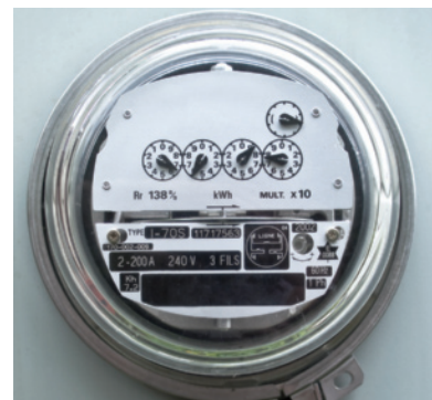
Figure 2 Electricity meters measure the amount of electrical energy used.