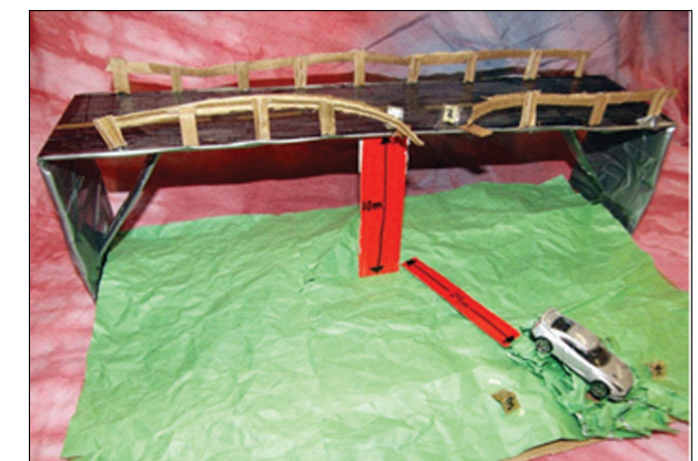
Fig. 2. Road Rage crime scene.